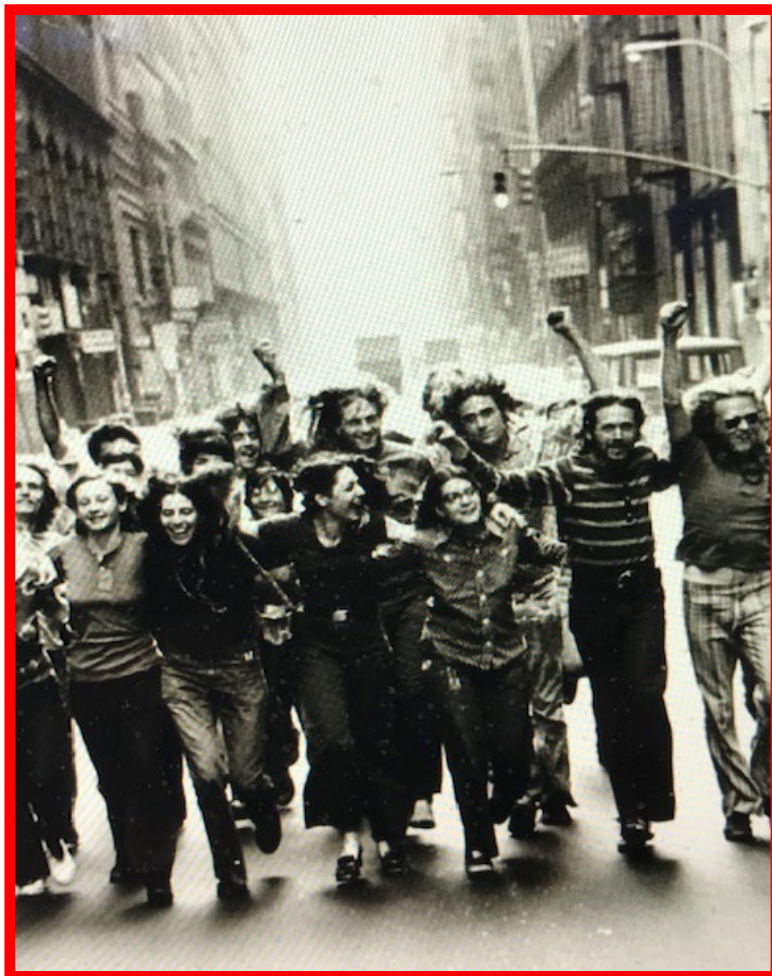
© Don Milligan, 'Gay Liberation: A brief moment in turbulent times' Manchester: www.studiesinanti-capitalism.net , June 2019